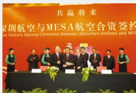
Officials of Shenzhen Airlines and Mesa Group at the launch of the new airline

The new airline, which has yet to be named, will initially operate 20 50-seat regional jets on domestic routes in China, including Shenzhen, Beijing, Chongqing, Xiamen, Nanjing, Kunming, Dalian, Shenyang, Xian, Zhengzhou and Nanning.