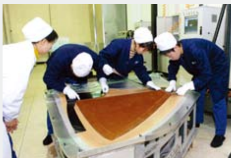
Workers at Harbin making material for wing-to-body fairing panels.

Harbin Group, an AVIC I affiliate company, will produce the fairing panels for 13 years with a yearly production of 100 sets.