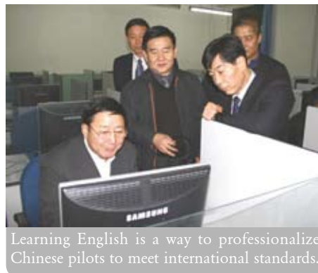
Learning English is a way to professionalize Chinese pilots to meet international standards.

The regulation was implemented on November 30. About 70 percent of the 11,000 domestic pilots in China will undergo the test.