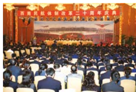
The 20th anniversary of the Southwest CAAC's aviation management reform marked a new beginning for the region's civil aviation.

Over the past twenty years, since its beginning in 1987, the Southwest Civil Aviation Administration of China has made significant progress. Several increases have been achieved, from a single airline based in the Southwest region, it now has ten airline companies based and running in the region. Passenger volume has increased