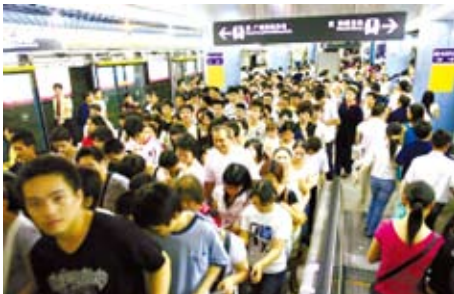
The 8th National Traditional Games of Ethnic Minorities and Various Expositions held in Guangzhou brought influx of passengers to Baiyun Airport.

On December 20th, the airport welcomed its 30 millionth passenger for 2007. This marks the airport's entry as one of the world's largest aviation hubs.