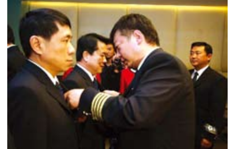
After being certified by the CAAC, 12 more Taiwanese pilots enlisted by Sichuan Airlines can now fly China's sky.

carrier plans to enlist another eight pilots from Taiwan by next year.