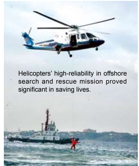
Helicopters' high-reliability in offshore search and rescue mission proved significant in saving lives.

that the Ministry of Communications is serious about establishing a concrete air rescue and salvage system.