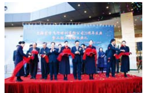
Shanghai Eastern Flight Training Co. commemorates its 20th year with Vice Minister Li Jian of the CAAC as guest of honor.

Company mainly trains flight professionals for the China Eastern Airlines. Currently, it also instructs pilots for domestic air carriers such as Air China, China Southern, Sichuan, United Eagle, East Star, and Spring Airlines. Pilots from foreign airlines such as the Far Eastern Air Transport, Air Hong Kong, and carriers from Mongolia, Indonesia, Vietnam, and Korea also receive flight and instructional training from the Company.