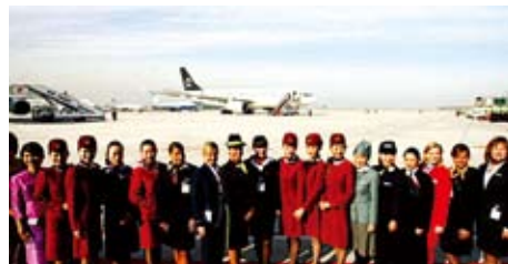
Star Alliance formally welcomes Air China and Shanghai Airlines to its international network in December 12th.

With Air China and Shanghai Airlines joining the airline network, the two China carriers can now avail themselves of the alliance's many benefits. They can now incorporate the Star Alliance frequent flyer programs with their own mileage programs and enjoy the many other services and benefits offered by the alliance. These include code sharing, fare products and convention plus, to name a few.