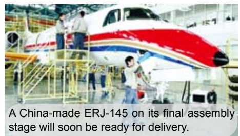
A China-made ERJ-145 on its final assembly stage will soon be ready for delivery.

After years of cooperation, the joint venture between Embraer and HAFEI Group received the AS9100 certification, first among the aviation sector in the Asian region. Out of the 66 aircraft ordered from Harbin Embraer, 20 ERJ-145 aircraft have been delivered.