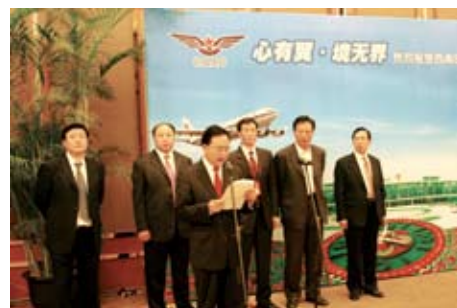
The Southwest CAAC recognized the important role of its officials and personnel in the institution's development.

By pioneering management reform, the Southwest CAAC has taken an enormous leap to develop civil aviation affairs for the entire Southwest region. For the past 20 years, the Southwest CAAC has gathered invaluable experience in managing, regulating, and directing the flow of the region's civil aviation development. Today, the Southwest CAAC has established itself as one of the pillars of China's civil aviation.