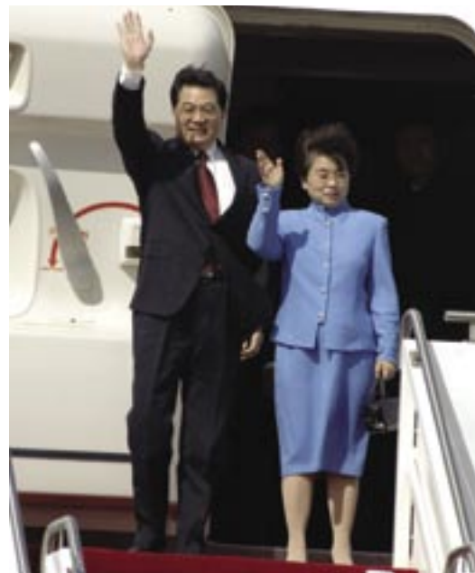
Chinese President Hu Jintao and his wife, Madame Liu Yongqing wave at the crowd upon arriving in Washington in April.

Boeing is set to establish a holding company in China to further boost its operations. It says that it "has a long term commitment in China. Boeing is committed to helping ensure safe, advanced commercial aviation in China."