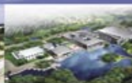
SHANGHAI ACC CENTER