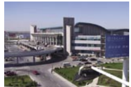
Urumqi International Airport gets a facelift worth US $335-million.

Urumqi International Airport in the Xinjiang Autonomous Region will construct a new terminal building in the second half of 2007.