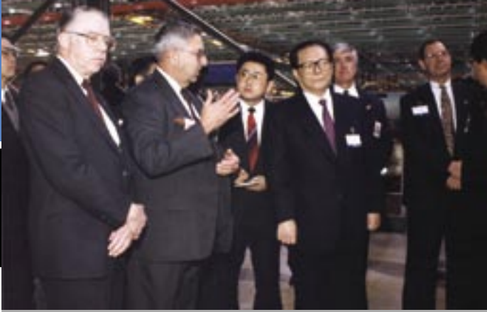
In 1993, China's President, Jiang Zemin toured Boeing's Everett factory.

until 2024 with a tag price of USD $770-billion as the Asia-Pacific region remains the largest market outside North America for new commercial planes. The company predicts that the Asia-Pacific region's total aircraft fleet will triple to 8,600 by 2024, based on the growth rate in air travel and air cargo markets.