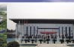
GUANGZHOU ACC CENTER