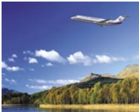
By 2009, the ARJ21 will be delivered to customers.

ARJ21 has a powerful takeoff and climb performance, thus allowing the use in airports with short runways.