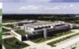
BEIJING ACC CENTER