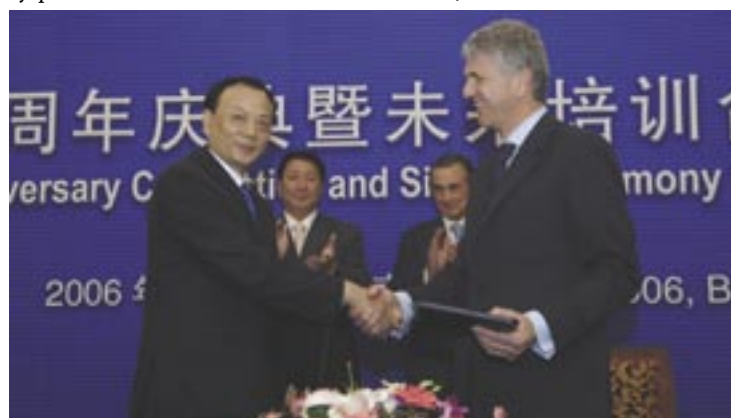
CAAC Vice Minister Yang Guoqing (left) and John Rose, chief executive of Rolls-Royce plc, shake hands after signing the new education agreement as Minister Yang Yuanyuan (back left) and Simon Robertson, chairman of Rolls-Royce plc, look on.

"The 'Top 300' is not only widely regarded as one of the best and most prestigious training programs in China, it is also recognized, by the governments of both our countries, as an outstanding example of international collaboration in the field of industrial education and training. Today we can look back on 19 completed courses which have trained more than 500 executives, many of whom are already occupying key posts in the CAAC and China's airlines," said Robertson.