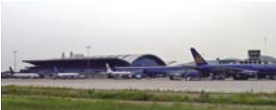
Nanning Wuyu International Airport expects to handle 5.6-million passengers by 2015.

The Civil Aviation Authority of China has approved the airport's plan to meet the expected volume of 5.6-million passengers and 53,000 flights in 2015.