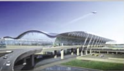
Shanghai Pudong Airport expansion project