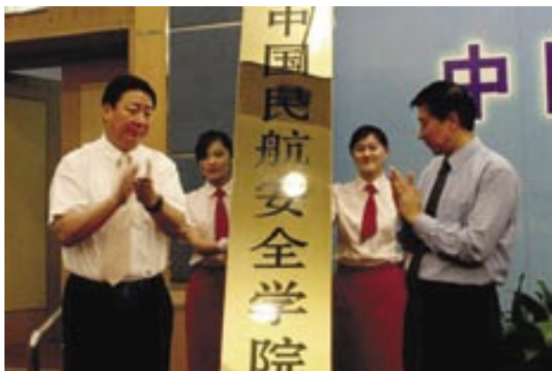
CAAC Minister Yang Yuanyuan (left) at the opening of the Civil Aviation Security Institute of China.

The establishment of the institute is part of CAAC's vision to improve industry security management and promote security management system construction.